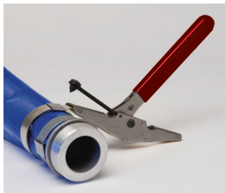
PVC Discharge Hose