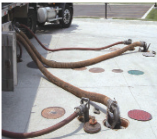
Tank Truck Hose