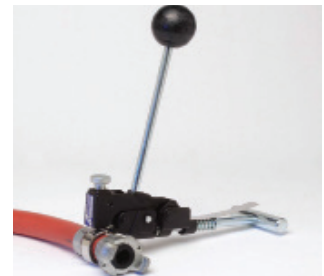
Rubber Air Hose